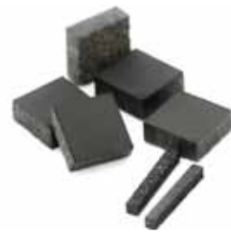
CVD (Chemical Vapor Deposition)

· Application : SDD, FDD, MDD · Almost same properties as natural diamond