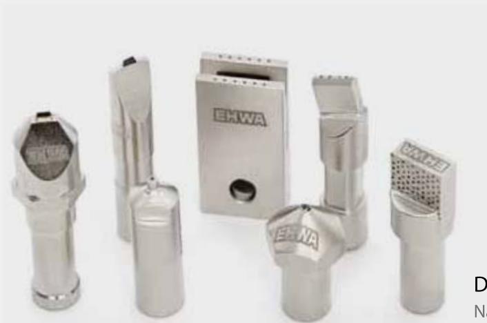
Diamond Dresser Natural, synthetic diamond